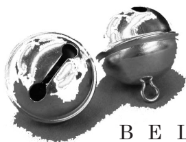
B E L L S